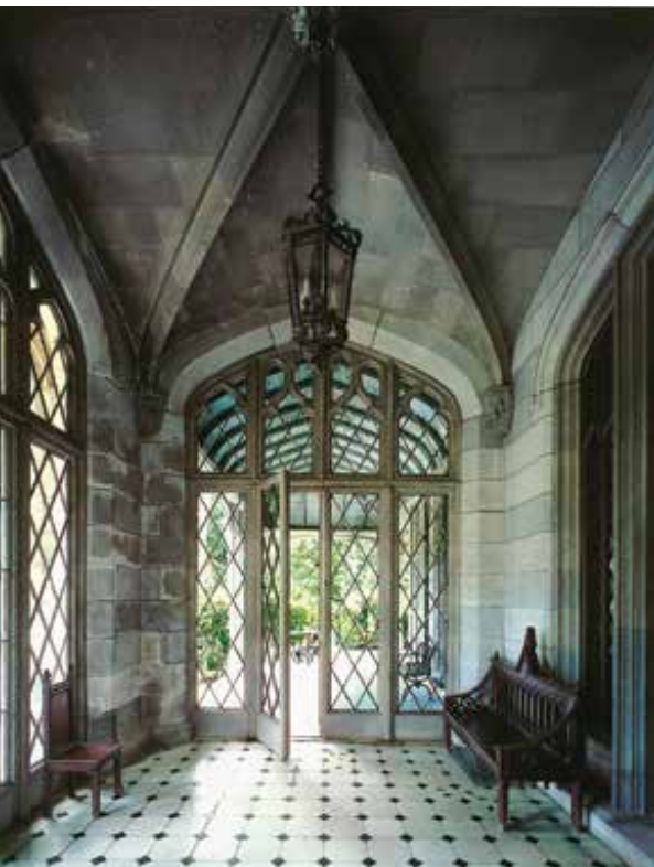
Left: Go back in time at Lyndhurst. Right: Tarrytown Music Hall isn't just for great entertainment, it also doubles as a venue.