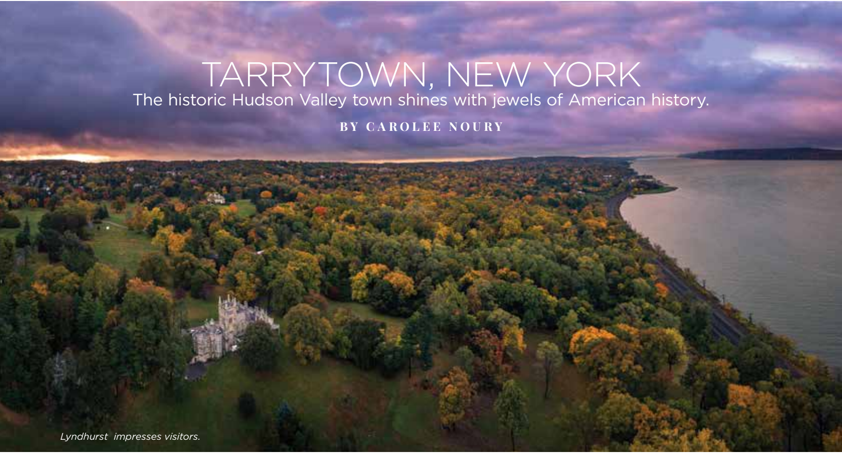
Lyndhurst impresses visitors.

TARRYTOWN, ON THE EASTERN SHORE OF THE HUDSON RIVER, features historic residences and breathtaking scenery. Fine dining and expansive lodgings are only the beginning. Local legends beyond neighboring Sleepy Hollow's Headless Horseman still hold court in museums and other sites of interest. It's the perfect setting to celebrate today's events with the backdrop of yesterday's success stories.